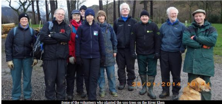
Some of the volunteers who planted the 500 trees on the River Ehen

Volunteers have branched out to help protect one of Cumbria's most endangered species.