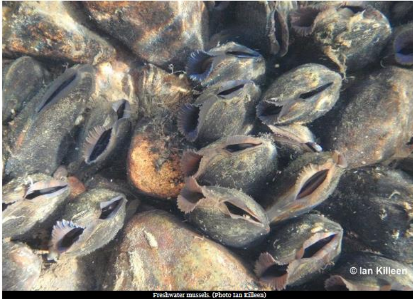
Freshwater mussels.