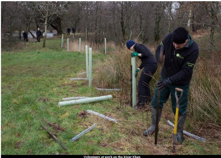
Volunteers at work on the River Ehen

An army of helpers descended on the banks of Ennerdale's River Ehen to plant 500 trees in a bid to safeguard the future of an important colony of freshwater mussels.