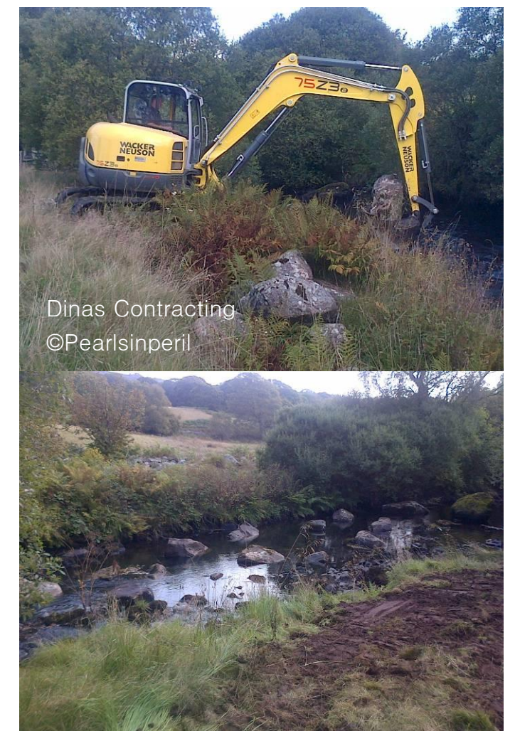
Dinas Contracting

This summer PiP have been involved in the introduction of clean gravel to seed areas that are lacking trout spawning beds. Boulders have been replaced into the river in order to create diversity in flow patterns so that areas of gravel deposits will develop naturally.