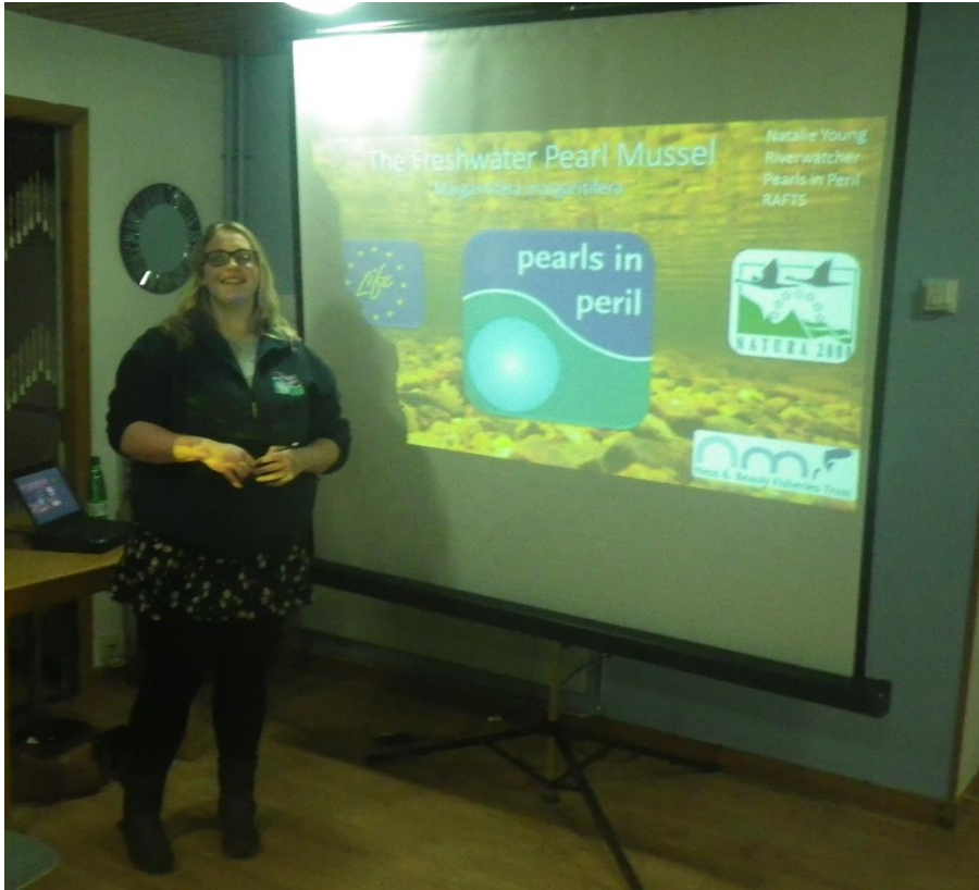
Launch in action

A press release detailing the launch received very good media coverage being published in: The Times, BBC News, The Scotsman, The Press and Journal, The Herald, BBC Radio Scotland and Moray Firth Radio.