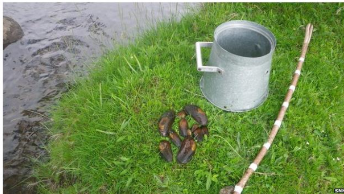
Mussels and equipment used to poach them