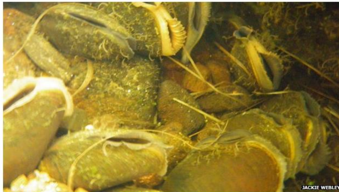
Freshwater pearl mussels are one of the world's most endangered species

Gamekeepers have offered their help in preventing the poaching of Scottish freshwater pearl mussels.